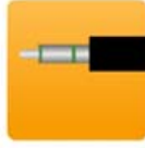
** Analog Cable